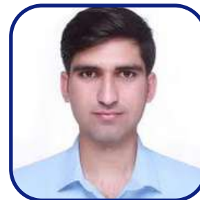
Hazrat Bilal University of Science and Technology China