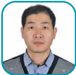
Rongbao Gao National Institute for Viral Disease Control & Prevent