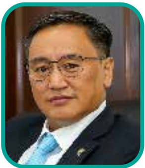
Chinburen Jigjidsuren Member of the Parliament of Mongolia, Mongolia