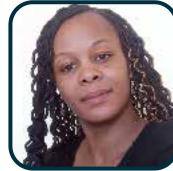
ViolahMpundu Biomedical Research Institute South Africa