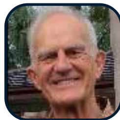
W. John Martin Institute of Progressive Medicine, USA