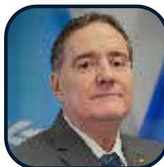
Jarbas Barbosa Director at the Pan American Health Organization, USA